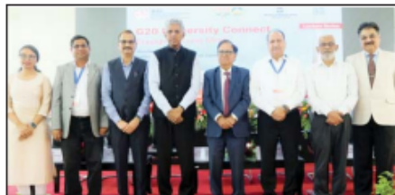
Guest key speaker during 'G20 University Connect' lecture series at IIM Jammu.